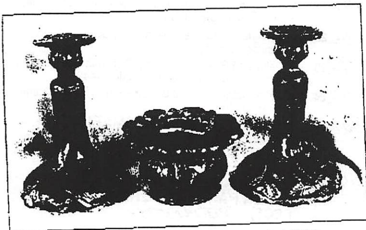
Candlesticks - Lot #176 & Spittoon - Lot #175